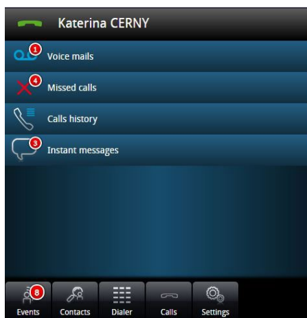
My IC Web Homepage

Employees have increased flexibility for participating in the workforce by combining the right device to suit their context with the right services for maximum efficiency. Another key asset is mobility, which allows workers to remain closely connected to their company, ensuring business continuity. The Alcatel-Lucent My IC Web application is designed for small- and medium-sized businesses (SMBs). It helps to significantly increase employee productivity by providing a full browser-based application that connects to their company's Alcatel-Lucent OXO Connect communication server and delivers communication services from an easy-to-use interface.